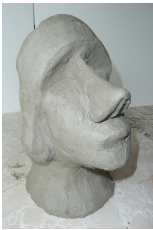
Moai of Easter Island