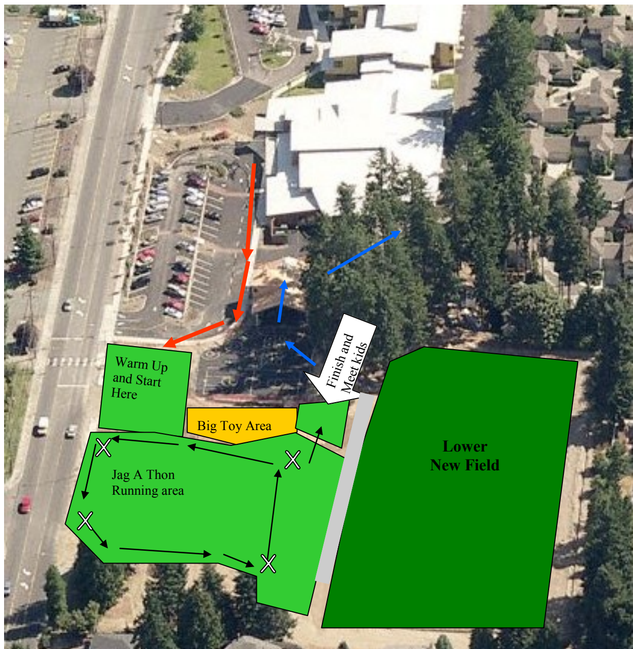
Jag A Thon Course with Start/End Zones and Enter/Exit Paths

PLEASE COME UP SIDEWALK , ALMOST TO THE STREET TO ENTER THE UPPER GRASS FIELD . DO NOT COME THROUGH THE COVERED PLAY AREA BECAUSE THAT IS WHERE CLASSES WILL BE EXITING AND WE WANT TO AVOID TOO MUCH CONGESTION. PLEASE DROP OF F YOUR STU- DENTS ON TIME AND PICK THEM UP ON TIME IF IT'S YOUR PE OR MUSIC TIME THAT DAY